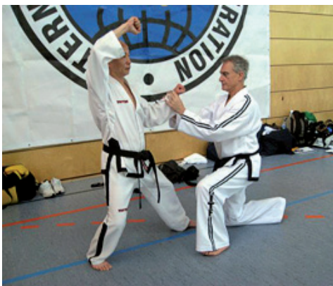
Grand Master Marano