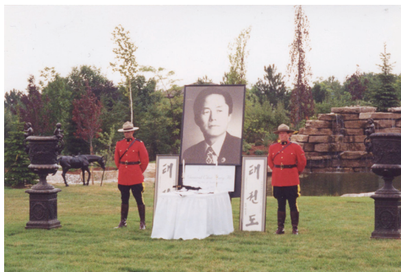
Grand Master Choi Hong Hi passes away, 2002