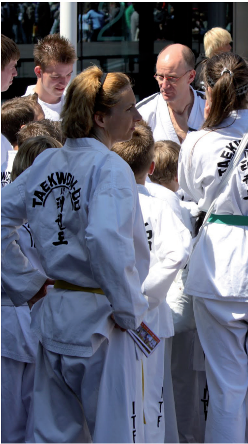
Community building, Barneveld 2012

Promoted to 1st degree 16 Promoted to 2nd degree 8 Promoted to 3rd degree 1