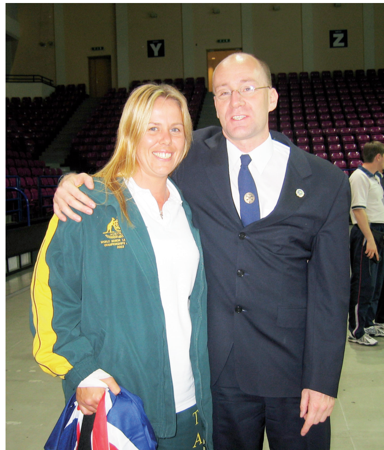
Australia, with power competitor