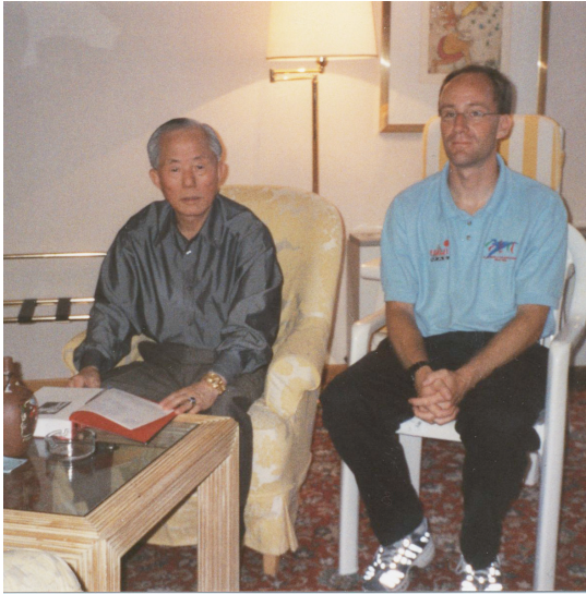
President Choi Hong Hi