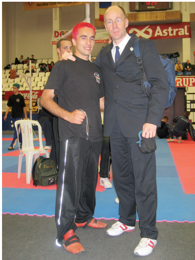
Romania, with sparring competitor