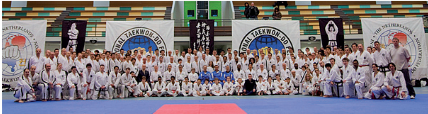
Organizer ICC, Utrecht 2010