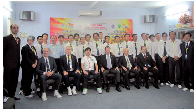
Head of umpires and educator, AC Vietnam