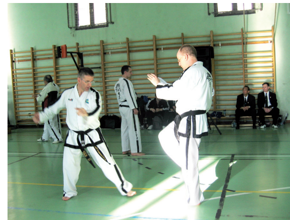
Hungary, sparring during umpire course