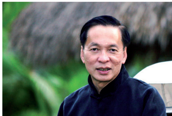
Grand Master Tran passes away, 2010