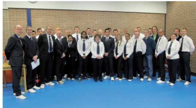
Head of umpires ITF-Netherlands